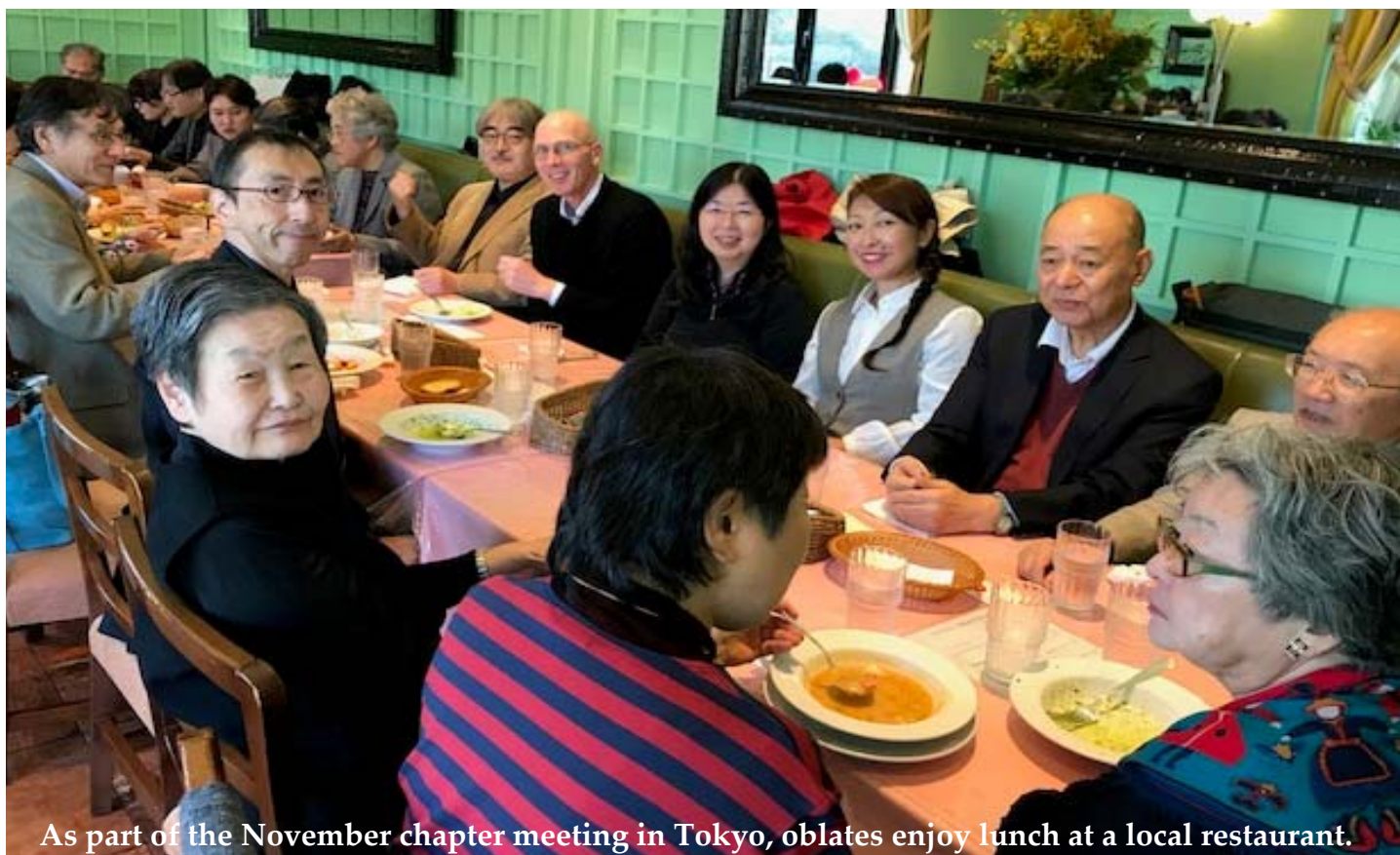
As part of the November chapter meeting in Tokyo, oblates enjoy lunch at a local restaurant.